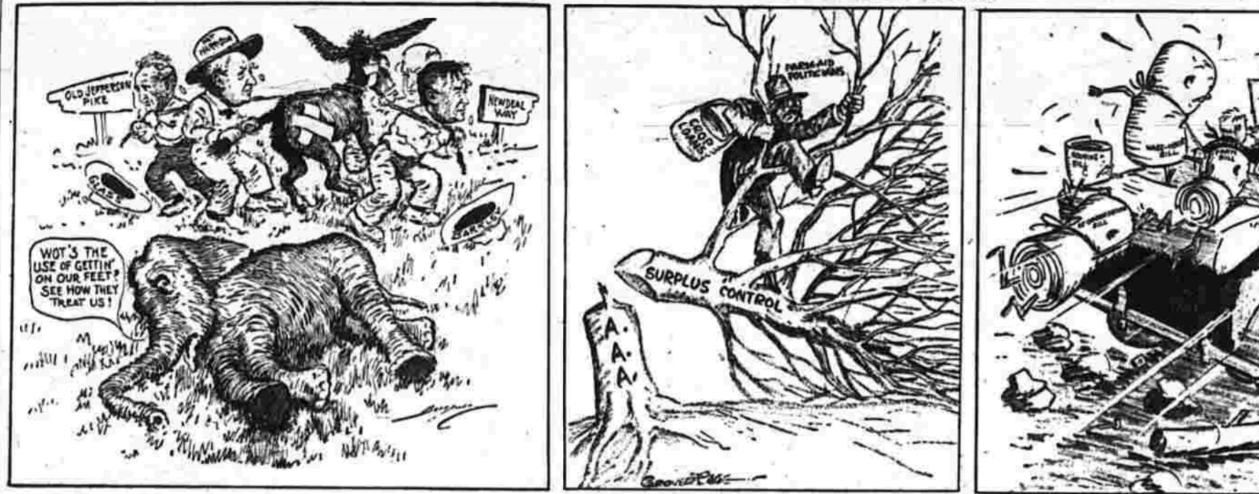
Cartoon in Washington Star 'News Note: Oldest Elephant In Captivity Is Forced To Lie Down' ... Page in Louisville Courier-Journal 'Looking For Fruit In A Dead Tree' ... Cartoon in Christian Science Monitor 'The Last Hundred Miles Are The Hardest.'